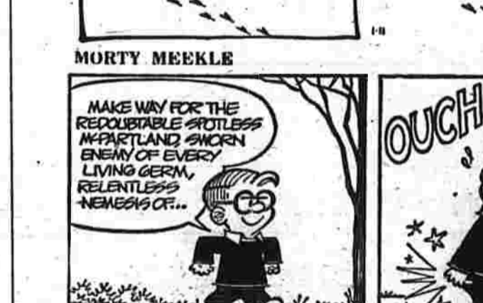
MURTY MEEKLE BY DICK CAVALLI