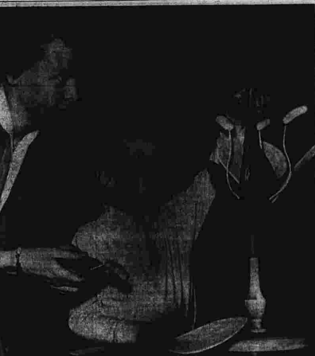
Model of Flower Joins Museum Exhibits