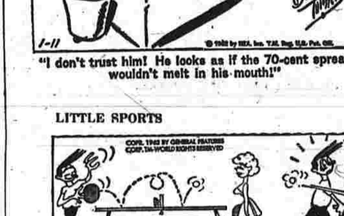
LITTLE SPORTS BY ROUSON